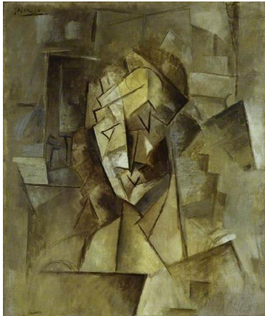
© Succession Picasso/DACS, London 2021; image © The Fitzwilliam Museum, Cambridge

You might like to use this resource alongside the Portraits video on the Fitzwilliam Museum schools website.